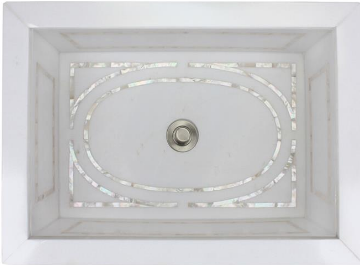
Shown with D005 SN