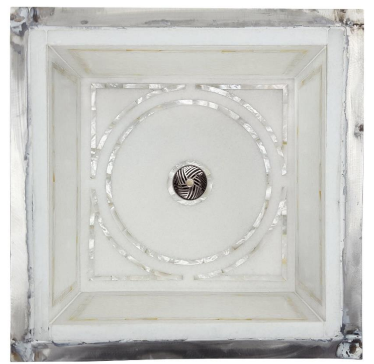
Shown with D013 PS-SCR02-N drain